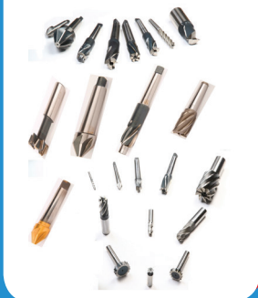
HSS END MILLS