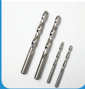
"Hurricane" HARDWARE DRILLS