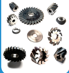
HSS MILLING CUTTERS