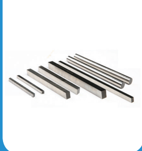
HSS TOOL BITS