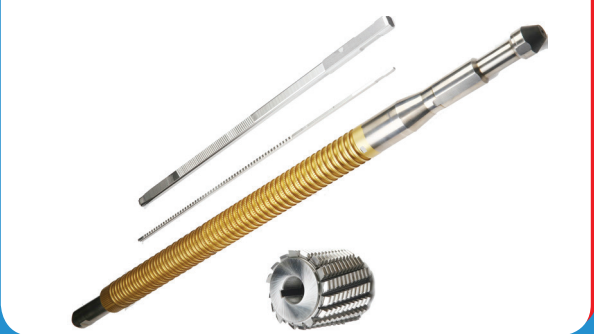
HSS BROACHES & HOBS