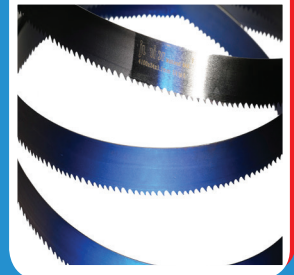
ADDISON junior® BI-METAL BAND SAW BLADES